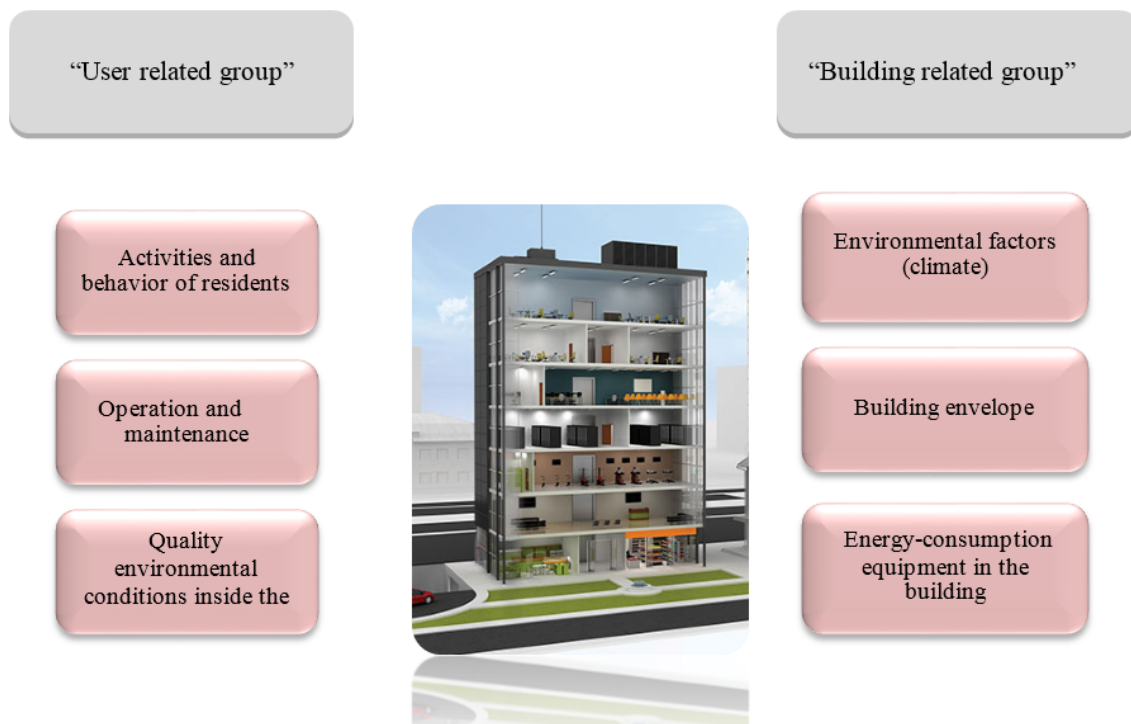
Fig. 1. Energy consumption in buildings

equipment and technologies has a wide scope and dimensions and various factors play a role in it. According to studies carried out by the International Energy Agency (IEA), energy consumption in buildings depends on six main factors, which are schematically shown in Fig. 1 [5]. These factors can be classified into two main groups: "dependent on the user" and "dependent on the building".